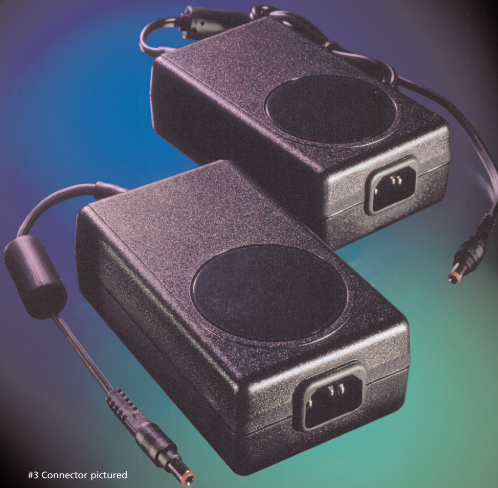
#3 Connector pictured